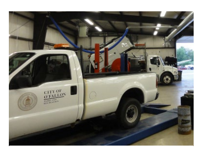
Veregy installed temp balancing destratification fans at the Fleet Building.