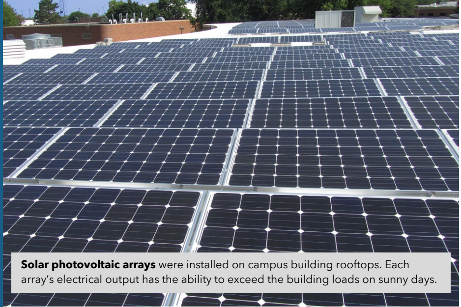
Solar photovoltaic arrays were installed on campus building rooftops. Each array's electrical output has the ability to exceed the building loads on sunny days.

A Carbon Neutral Campus becomes a reality through Energy Saving Initiatives