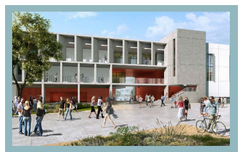
Building 2B Dry Computational Lab